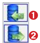
Figure 4. Import and Export Database Icons

For additional guidance, refer to INVIA's Qualifying Patients for a Normals Database, Create a Normals Database and Add Patients to a Normals Database reference guides.